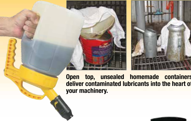
Open top, unsealed homemade containers deliver contaminated lubricants into the heart of your machinery.

With 5 different lid types designed to fit each of the 5 different drum sizes, you can mix and match the components to build heavy duty durable containers that will meet your oil transfer requirements.